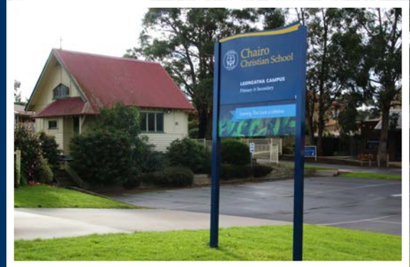
Leongatha Kinder – Year 10