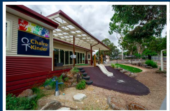
Traralgon Kinder – Year 8