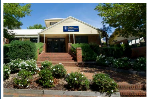
Drouin / Drouin East Kinder – Year 12