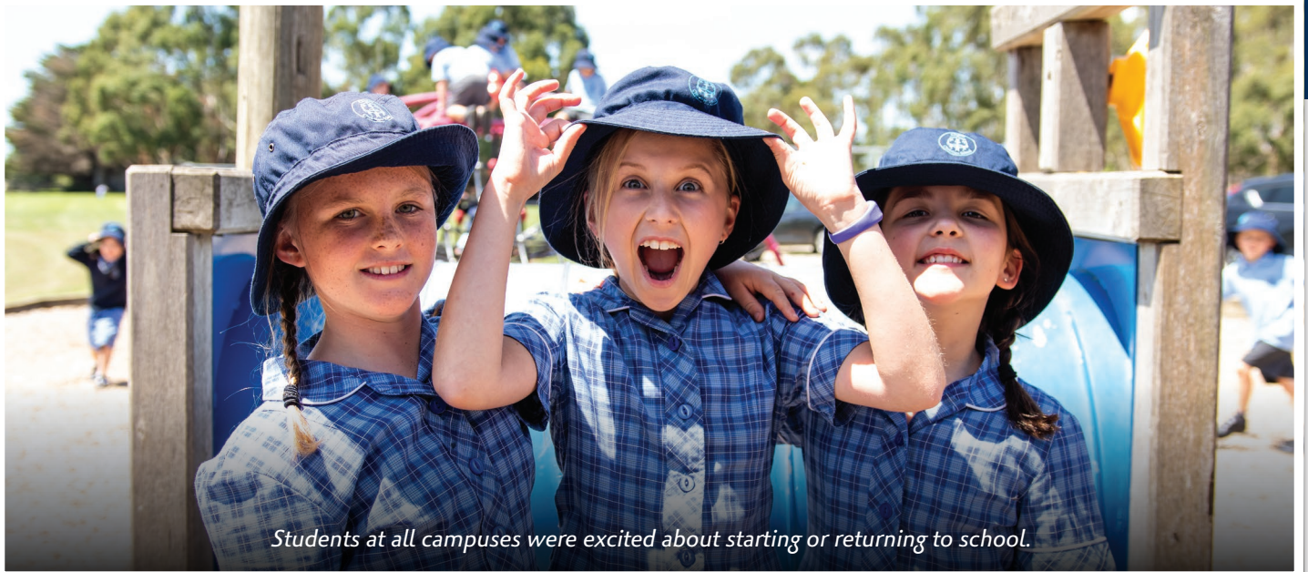
Students at all campuses were excited about starting or returning to school.